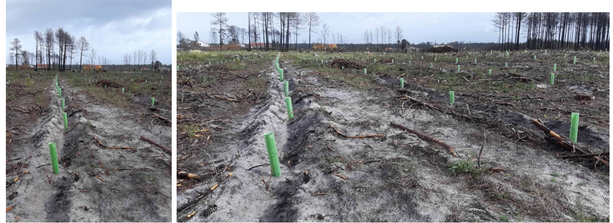
Planting lines in P2 with photodegradable protectors.