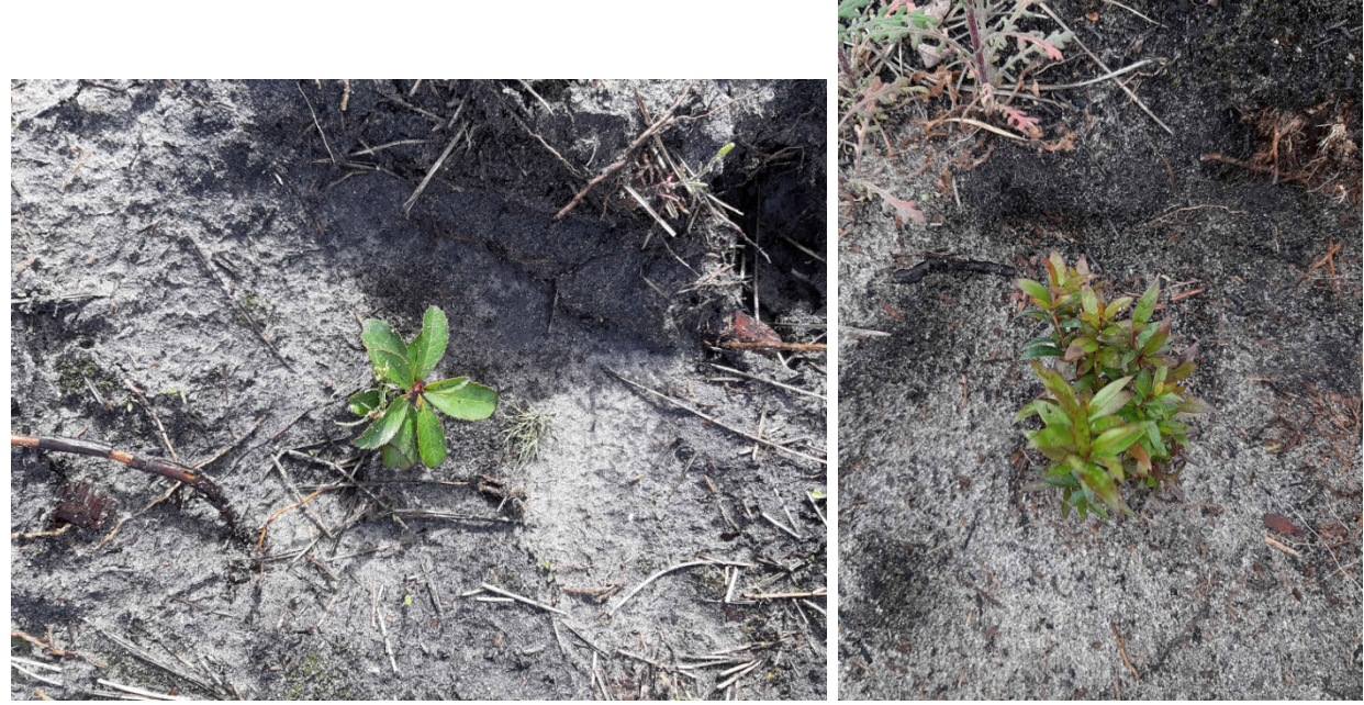
Strawberry tree (left) and common myrtle (right) planted on the parcel P1.