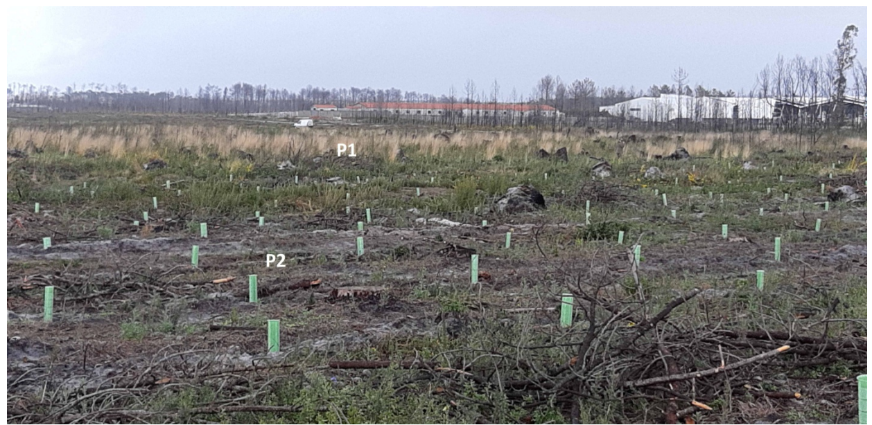
Parcels P1 and P2 after the intervention.