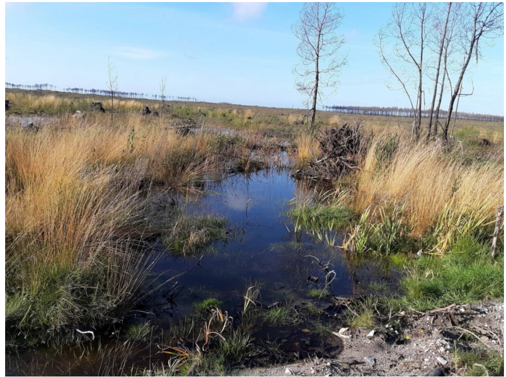
Parcel P1 after the intervention.