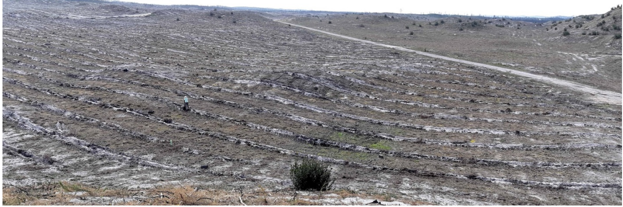
Parcel P3 after the preparation of the site.