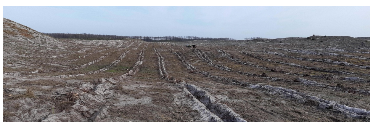
Parcel P3 after the preparation of the site.