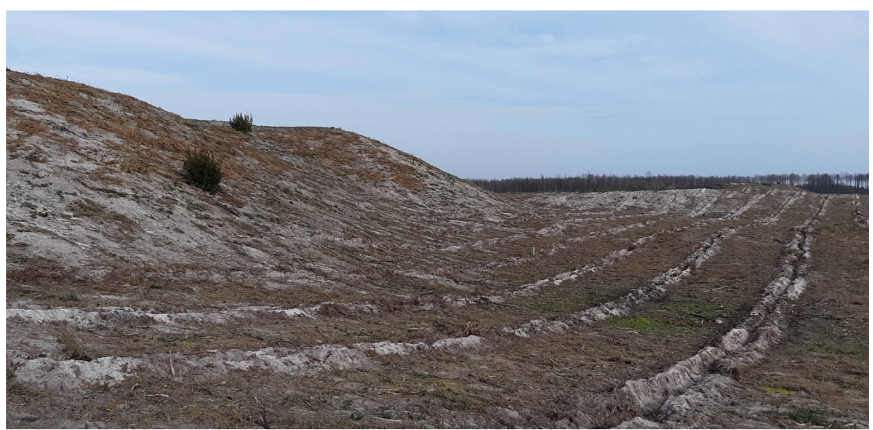
Parcel P3 after mechanical preparation of the land (except for the part with higher slope).