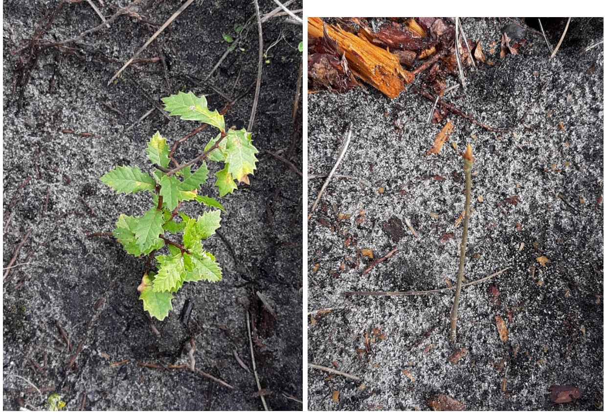
Portuguese oak (left) and common oak (right) planted on the parcel P1.