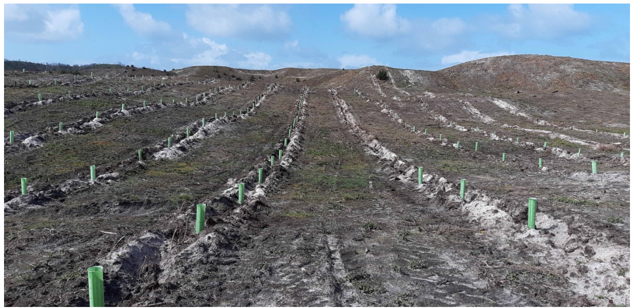
Parcel P3 after planting.