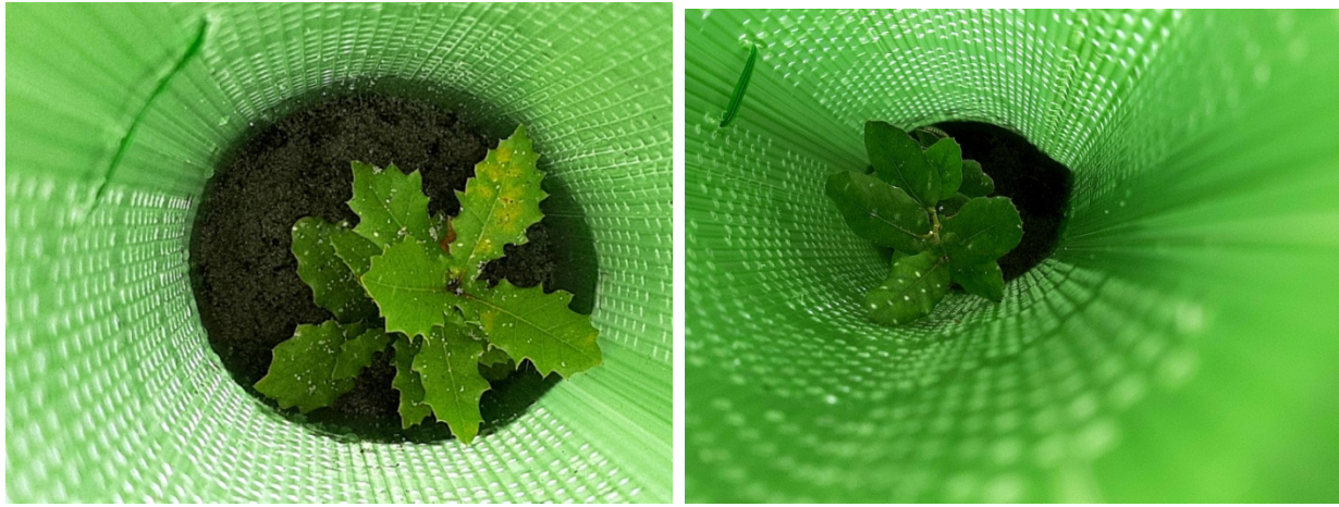
Portuguese oak (left) and cork oak (right) planted in parcel P3.

Planting lines (left) and exploitation of the natural regeneration of strawberry tree (right) in P3.