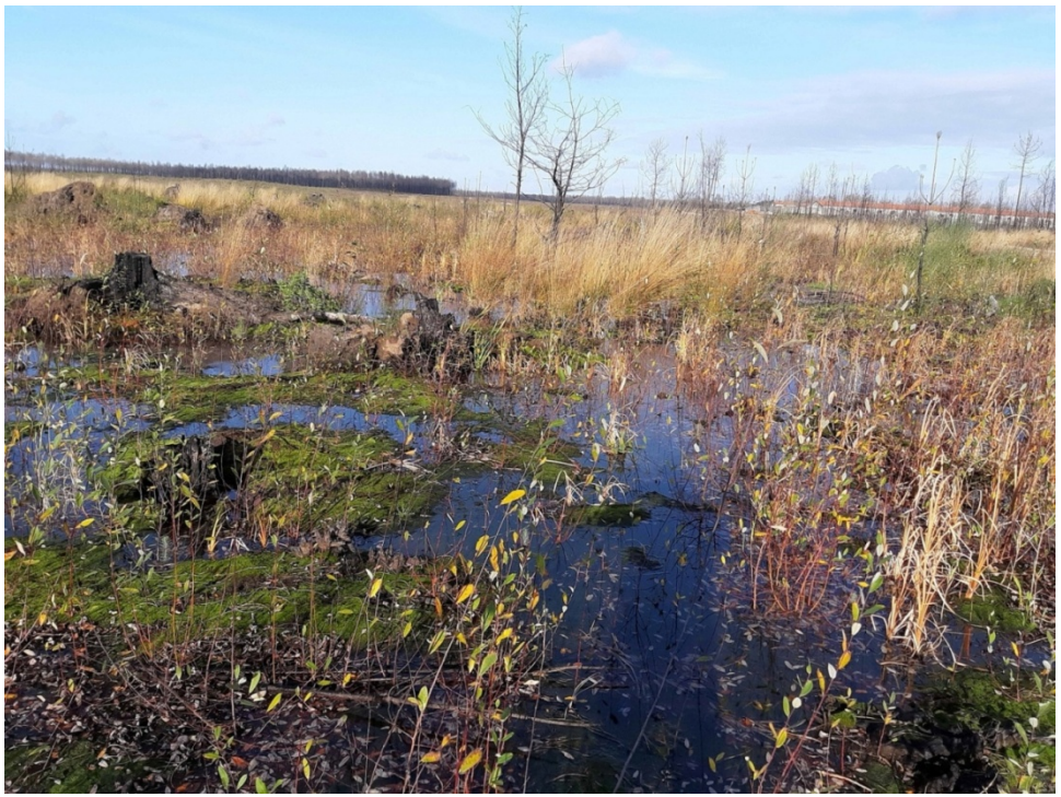
Parcel P1 before the intervention.