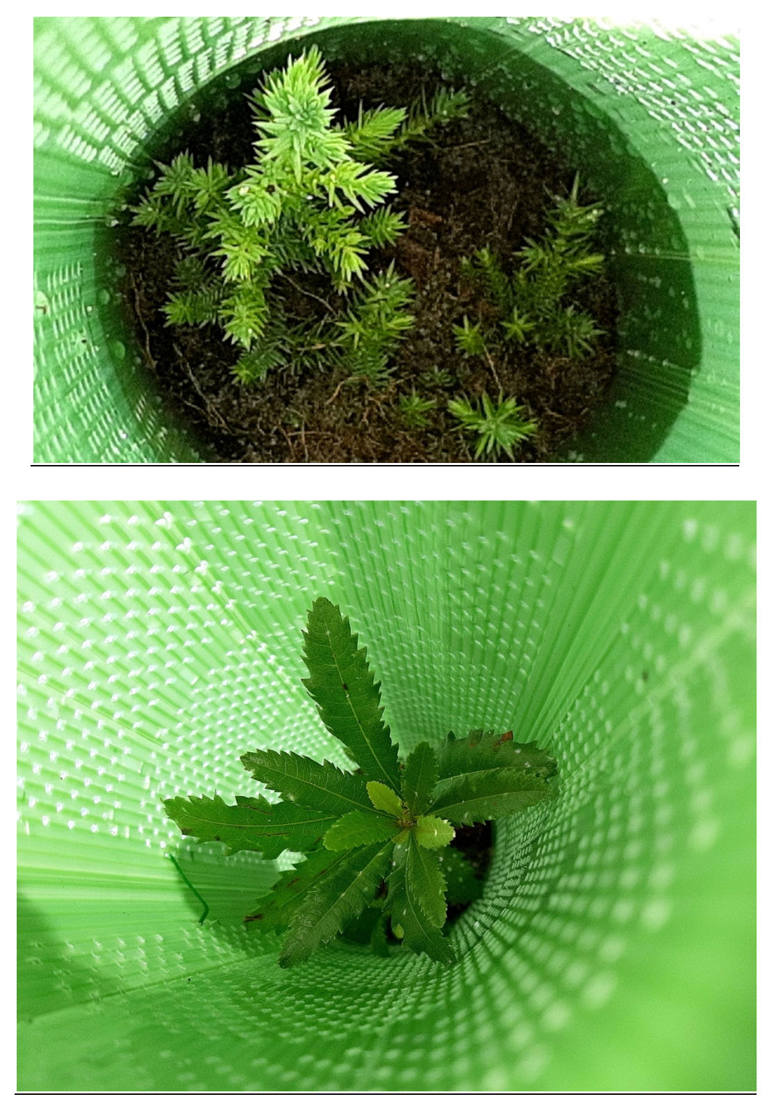
Juniperus turbinata (top) and Myrica faya (bottom) planted in parcel P3.