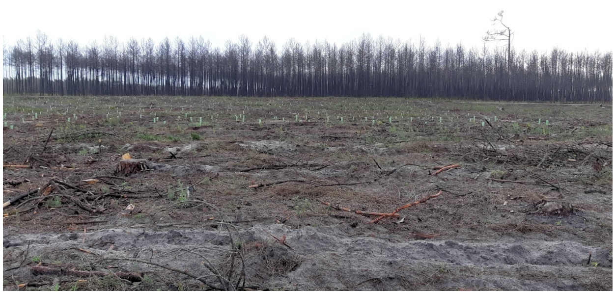
Parcel P2 after the intervention.