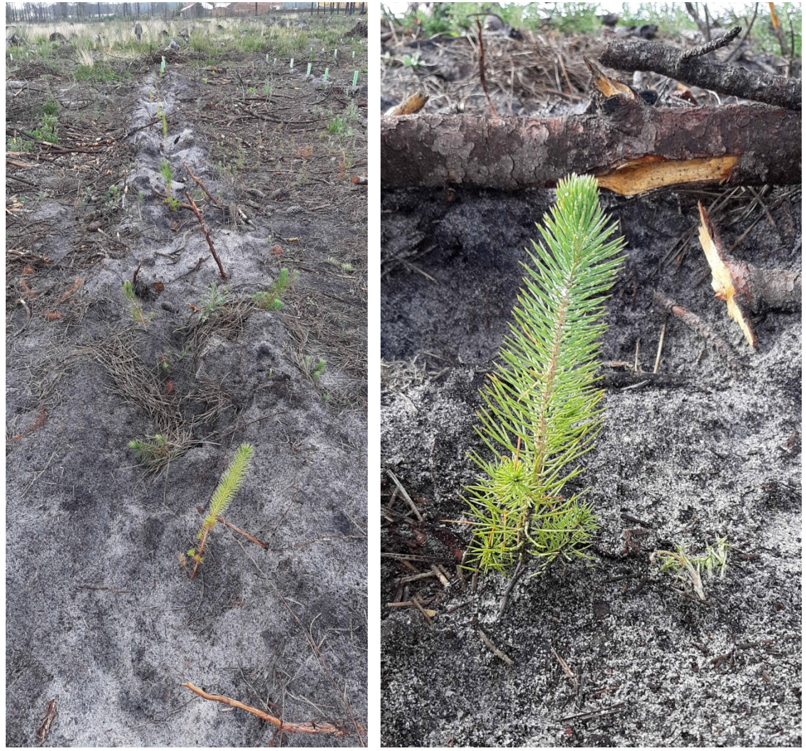
Pine seedlings planted in P2 without photodegradable protectors.